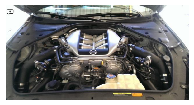
1. Nissan GTR Engine Bay with Aluminum Pipes