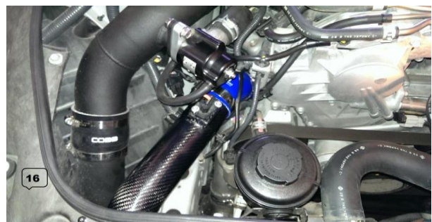
16. Passenger Side View