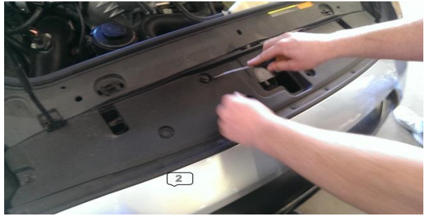
2. Remove the Front Bumper Upper Panel by Pop up the Plastic Clips