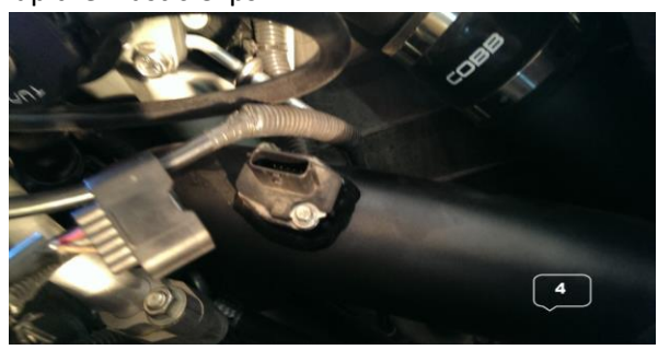
4. Unplug the MAF Sensor on Both sides