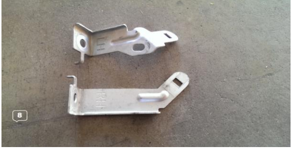
Removed to be able to Install the CF Intake Pipes