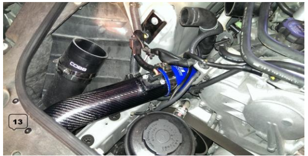
13. Over All View of the CF Pipe installed