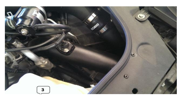
3. MAF Sensor Location