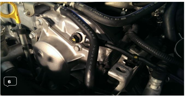
6. Disconnect the Negative Cable on Both sides