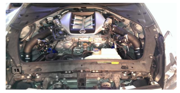
15. Complete View of CF intake Pipes Installed