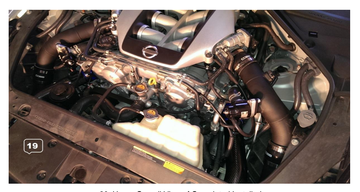
20. Upper Overall View of Completed Installed