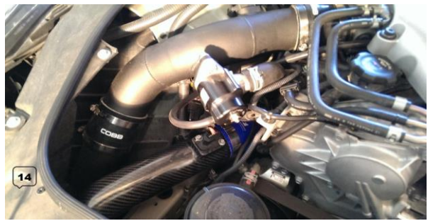
14. Mount the Upper Hard Pipes back on both sides