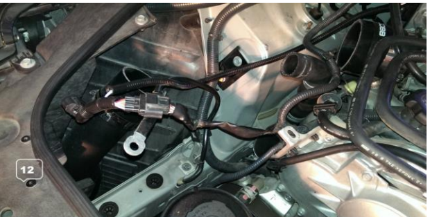
12. Same Procedures Apply to the Other Side