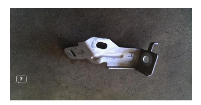
7. Remove the Sensor Wire Brackets on Both Sides, 8. RH and LH Wire Sensor Brackets, Required See Bottom Pictures