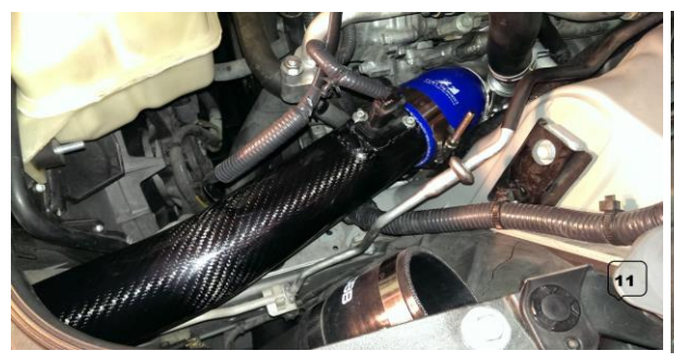
11. Using 2.75"-2.5" Reducers and Clamp to the Turbo Housing, Plug the MAF sensor Wire Back on the MAF Sensor